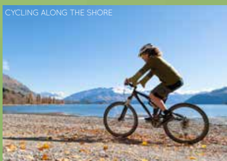
CYCLING ALONG THE SHORE