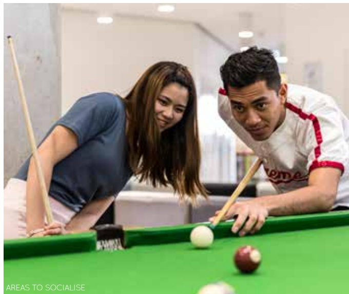
AREAS TO SOCIALISE