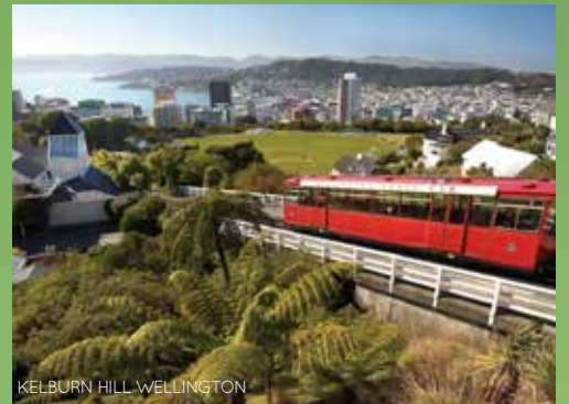
KELBURN HILL WELLINGTON