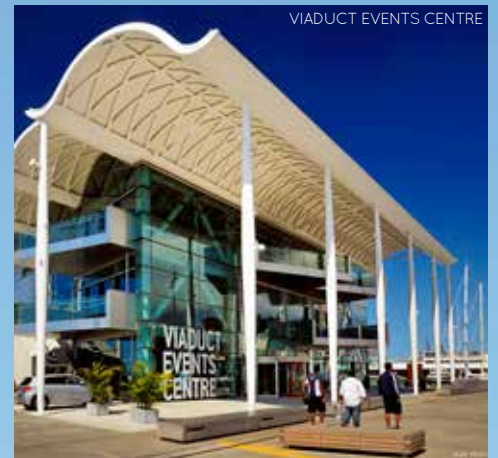
VIADUCT EVENTS CENTRE

Feel welcome in this multicultural city with great food, shopping, parks and entertainment.