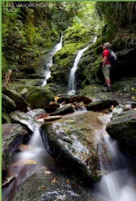
LAKE WAIKAREMOANA TRACK