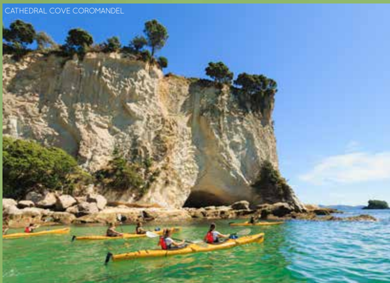
CATHEDRAL COVE COROMANDEL